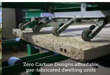
Zero Carbon Designs affordable pre-fabricated dwelling units