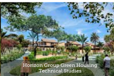
Horizon Group Green Housing Technical Studies