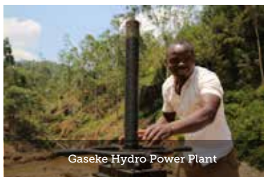
Gaseke Hydro Power Plant